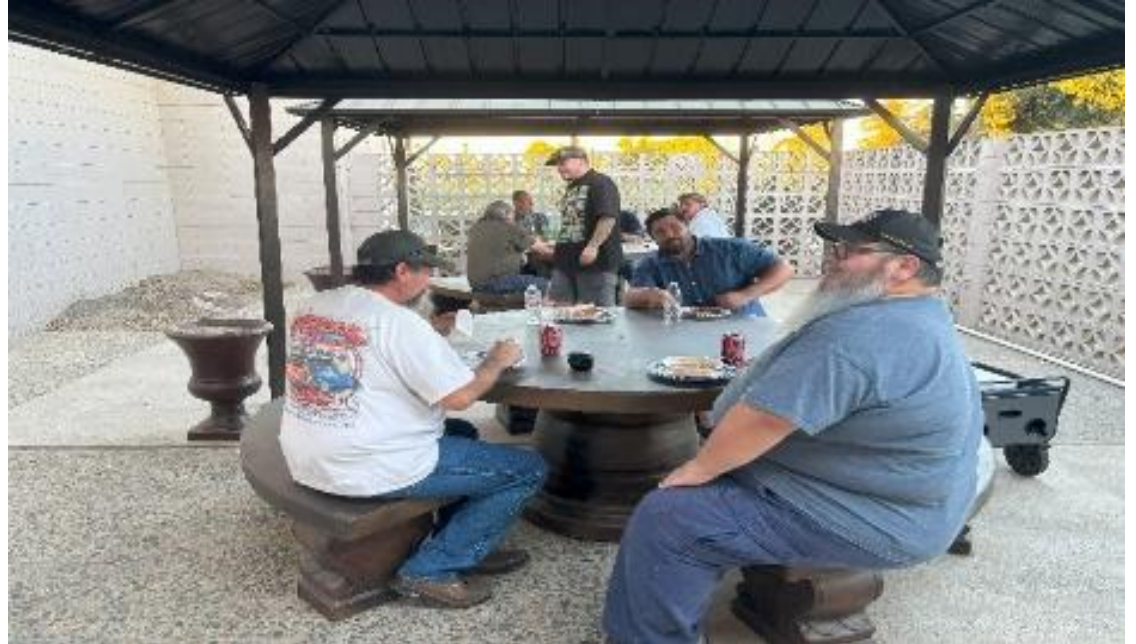
Dinner on the Patio August 2025