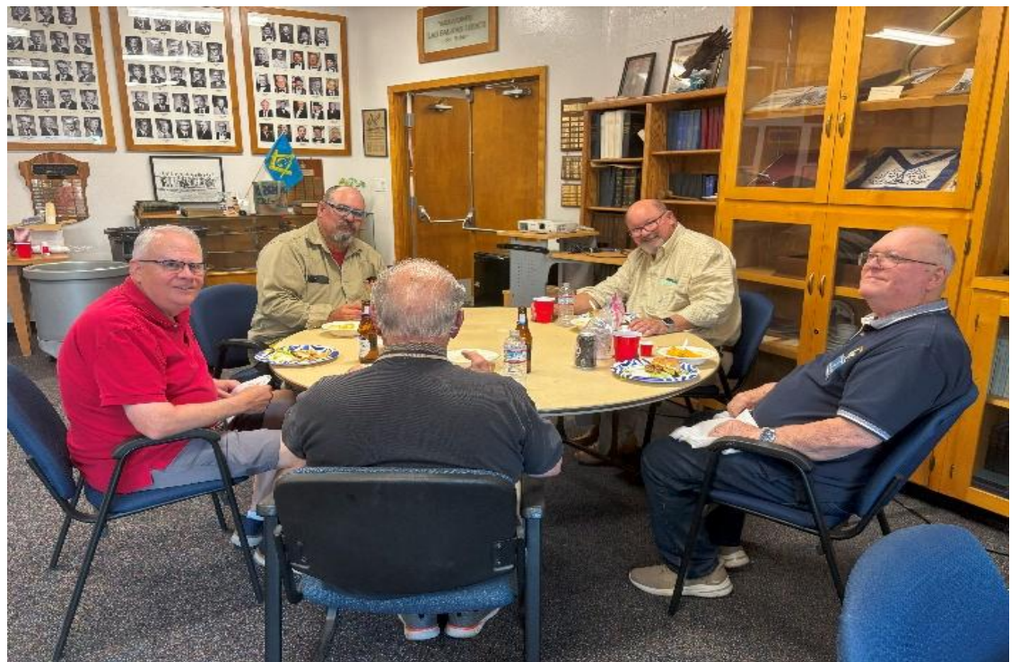
Please plan on joining us this month.