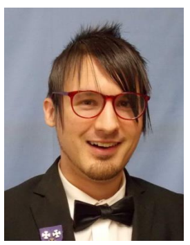
From the West,

I hope all have been well. We are all in this restrictive and scary situation together, and this situation affects everyone differently. The virus situation has caused disruptions and extra stress in our families, workplaces, as well as the existential anxiety of wondering if we're going to be okay each time we leave our home.