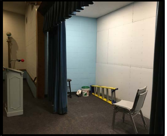
Working in Harmony!