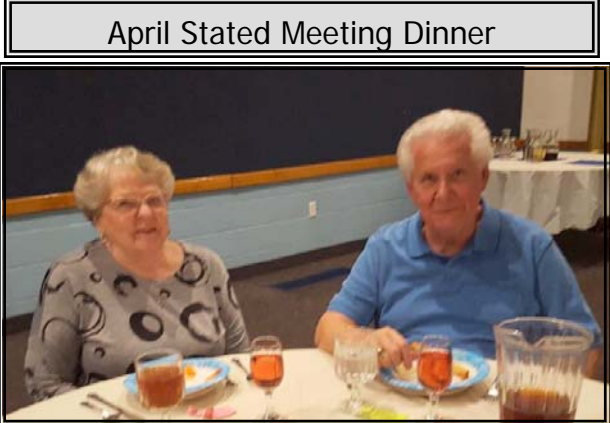
April Stated Meeting Dinner