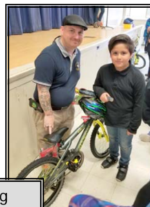
Wilson School Bike, Back Pack and Book Bag Drawing