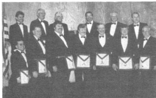
The newly installed Las Palmas Officers all happy and smiling.