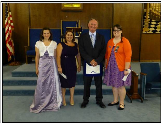
Fresno Lodge No. 247