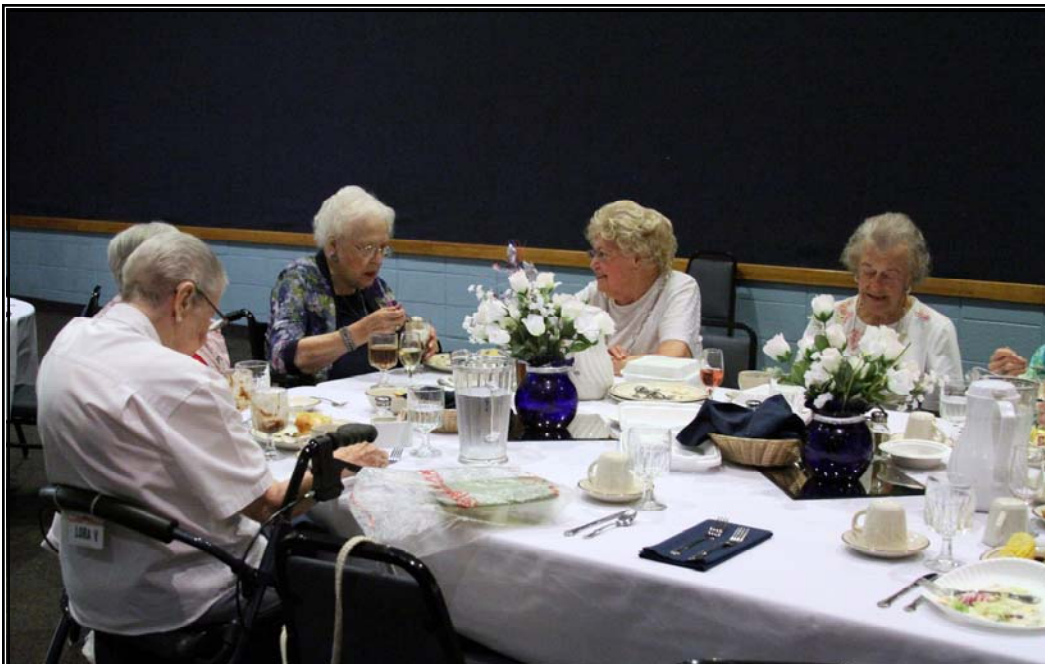
Widows at Las Palmas Masonic Center June Stated Meeting Dinner