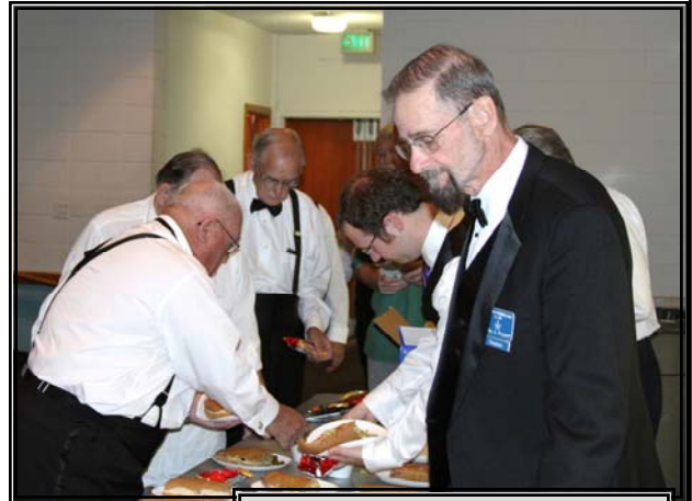
June Stated Dinner