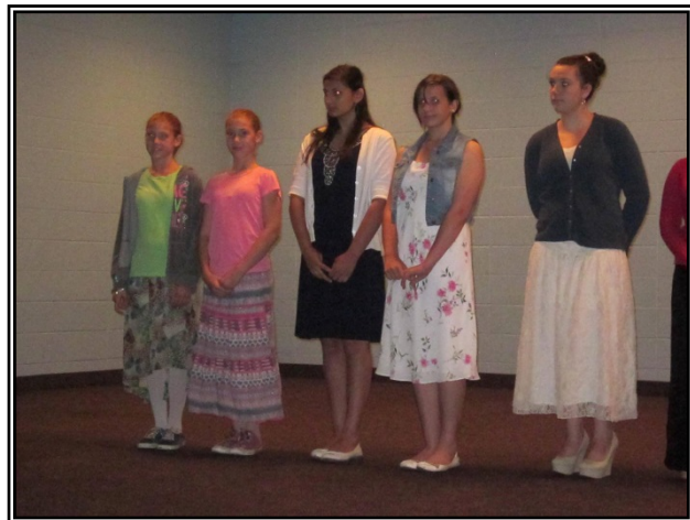
Las Palmas-Ponderosa Lodge No. 366