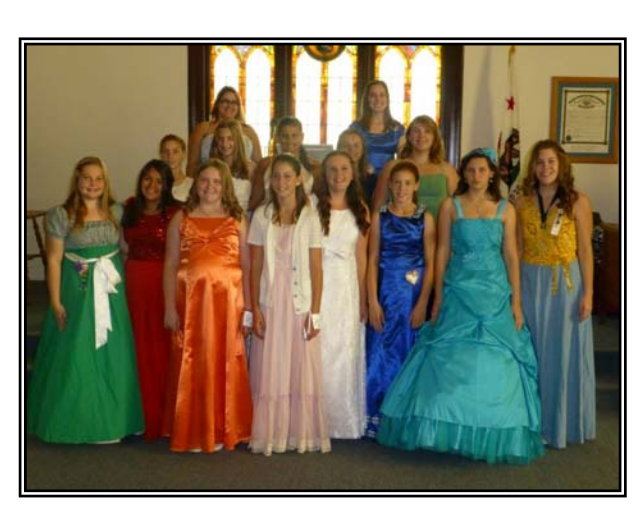
Heart of the Valley Assembly