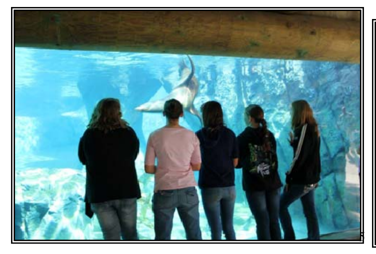
Behind the scenes at the Sea Lion Cove