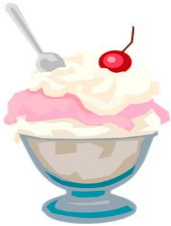
Nile Ice Cream Social