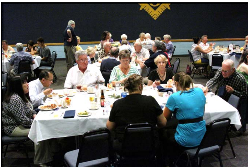
July Stated Meeting Dinner