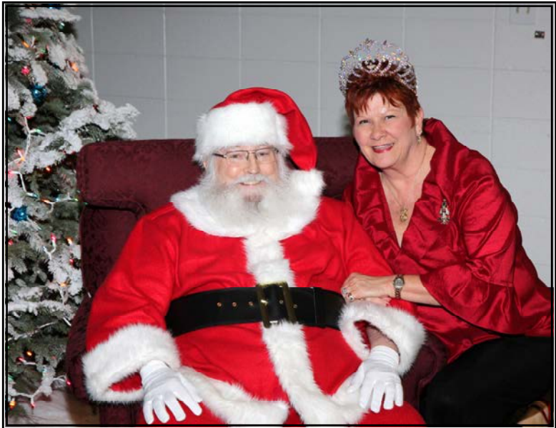
December 14, 2011, Nile Stated Session, an evening with Santa