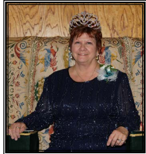
Queen, Dale Obernolte