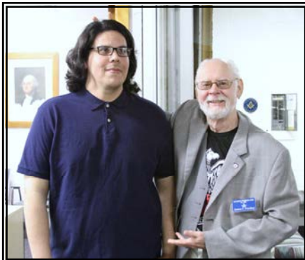
April Stated Meeting Dinner