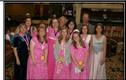
Youth Orders Month