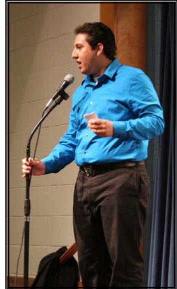
Beer, Berrocks and Comedy