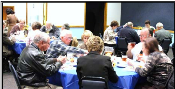
November Stated Dinner