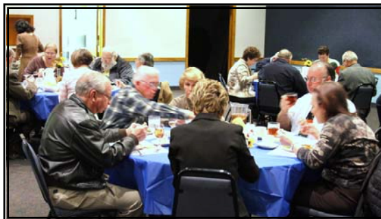
November Stated Meeting Dinner