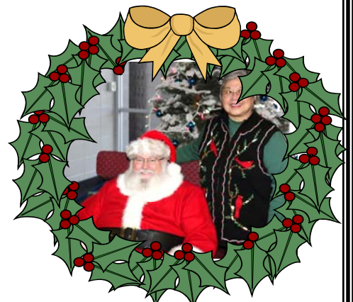
Mr. & Mrs. Santa Claus