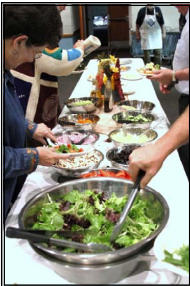
Salad Bar and Appetizers

In July of 1919 we had approximately 375 members of which 21 were actively serving in WW I WW I ended officially on November 11, 1919. At the December, 1919 Stated Meeting the Secretary read 19 Petitions for Degrees and 3 Applications for Membership by affiliation.