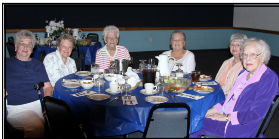
Widows enjoying the September Stated Dinner