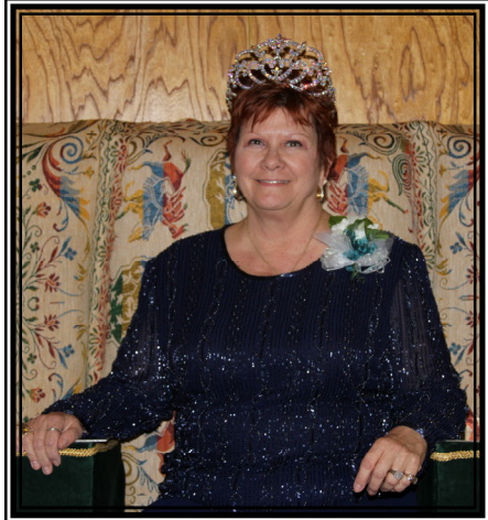
Queen, Dale Obernolte