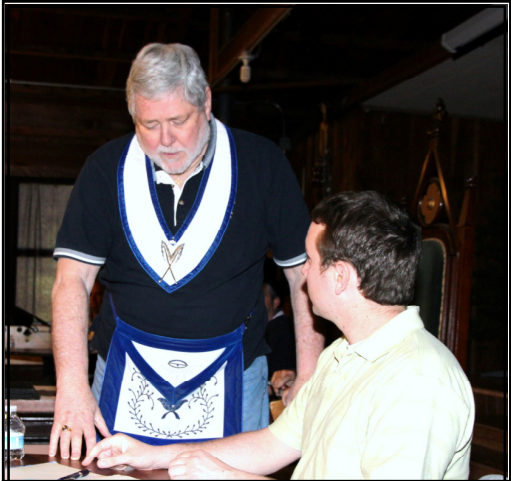
Signing the By-Laws