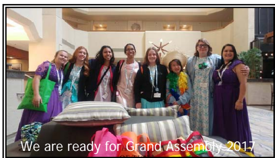
We are ready for Grand Assembly 2017