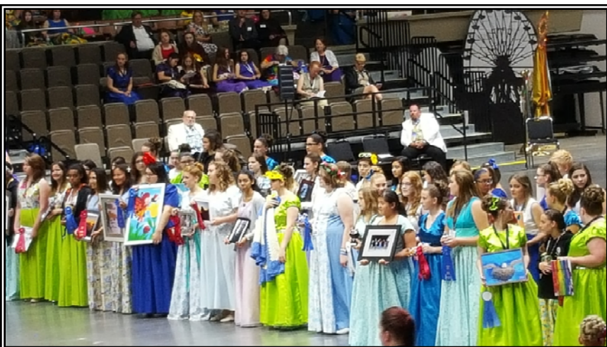
Arts and Crafts Participants