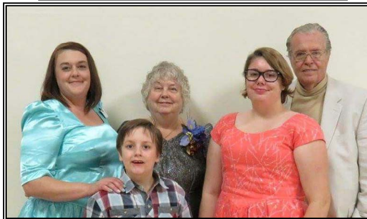
Ft Millerton Chapter Installation of Officers-Worthy Matrons Family