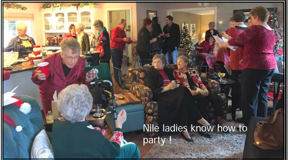
Nile ladies know how to party !