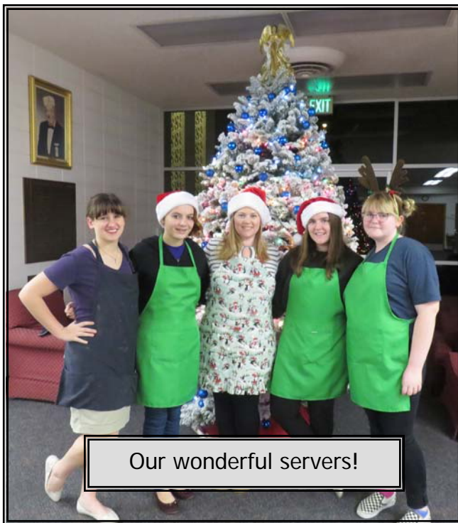
Our wonderful servers!