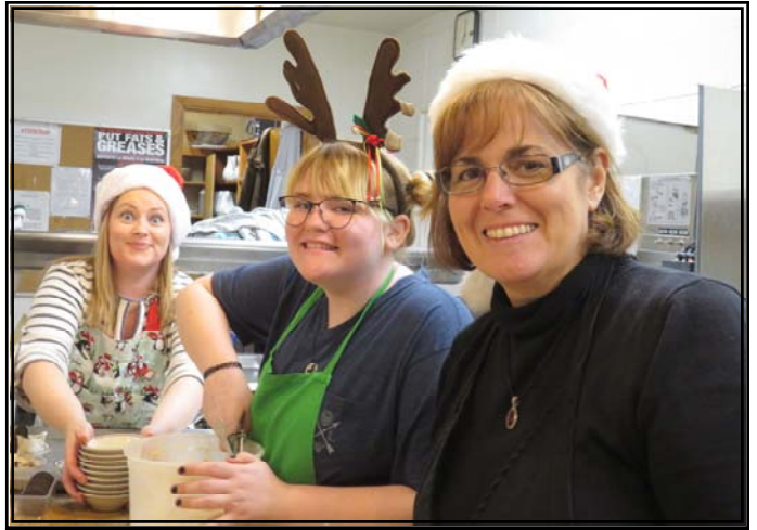
Heart of the Valley happy servers!