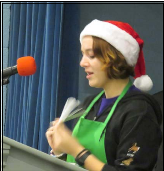
Inviting everyone to buy tickets for the Rainbow pulled pork dinner