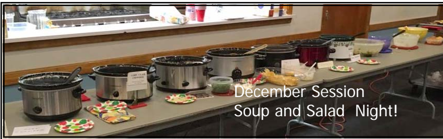
December Session Soup and Salad Night!