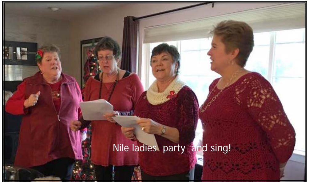
Nile ladies party and sing!