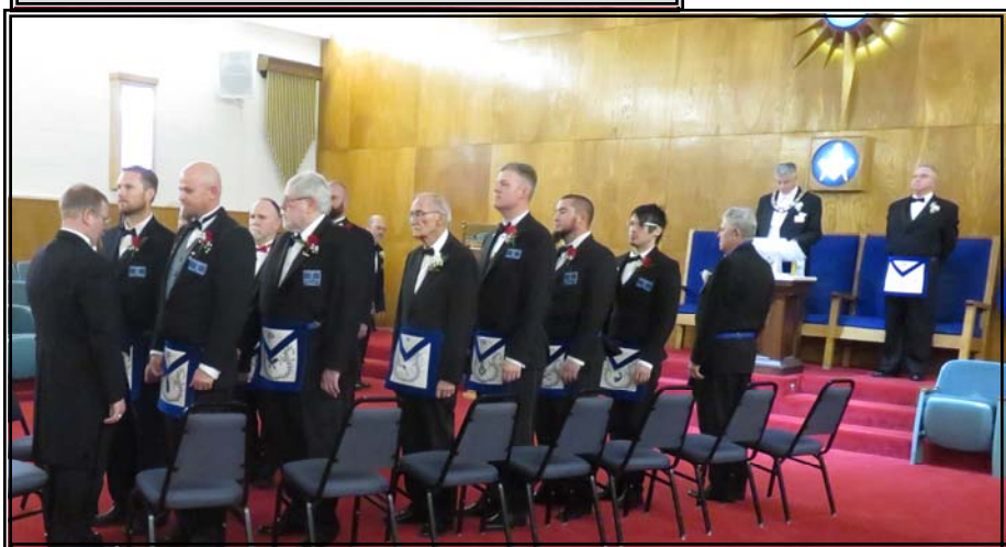
2017 Officers prepare to be installed