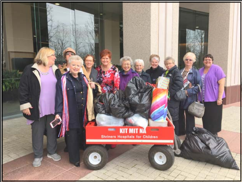
3 pictures above are from the Queen's open house in December. To the left is the Shriners contribution delivery.