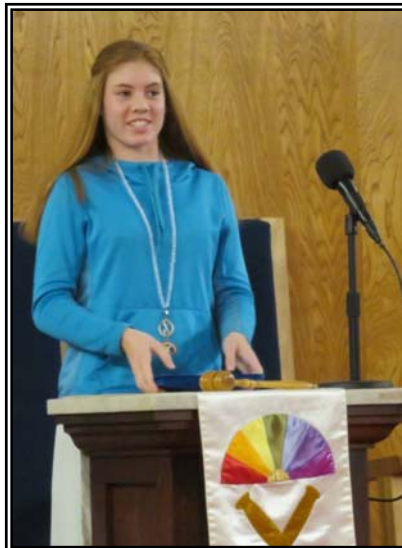
Worthy Advisor Elect