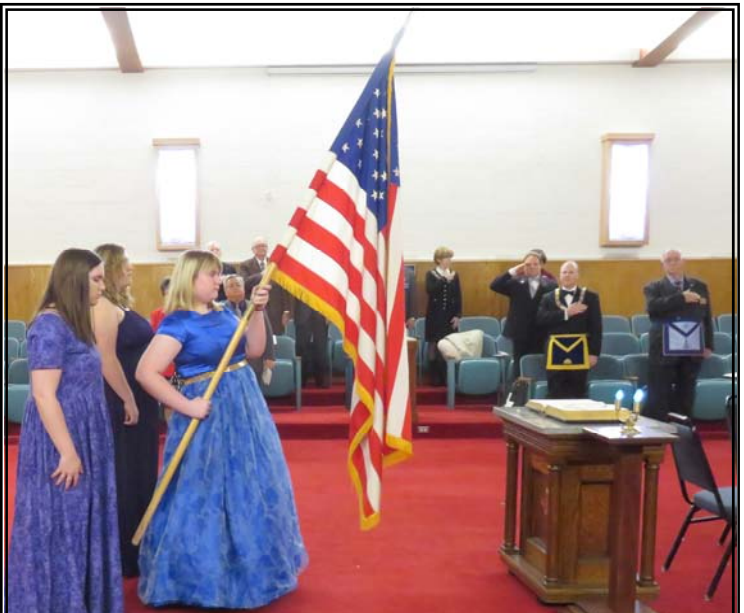
Heart of the Valley Assembly presents the flag