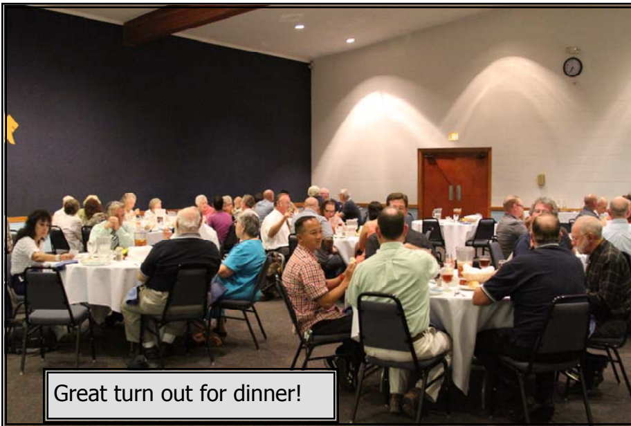
Great turn out for dinner!