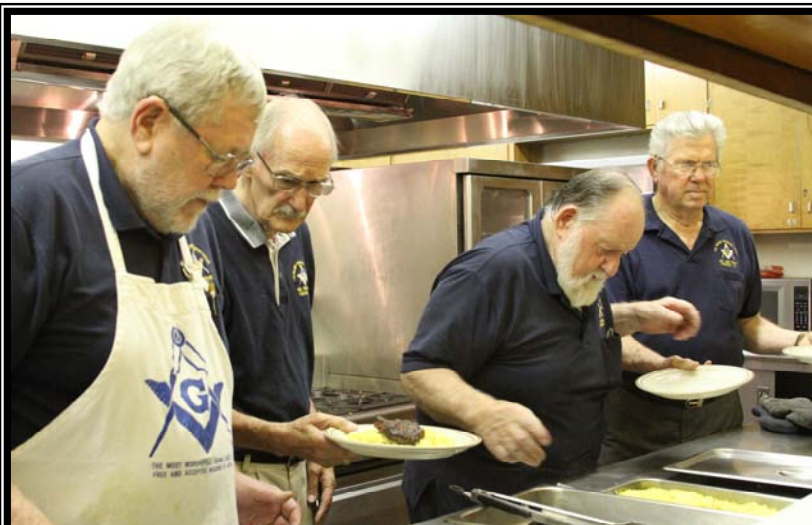
311 Years of Talent, looking puzzled