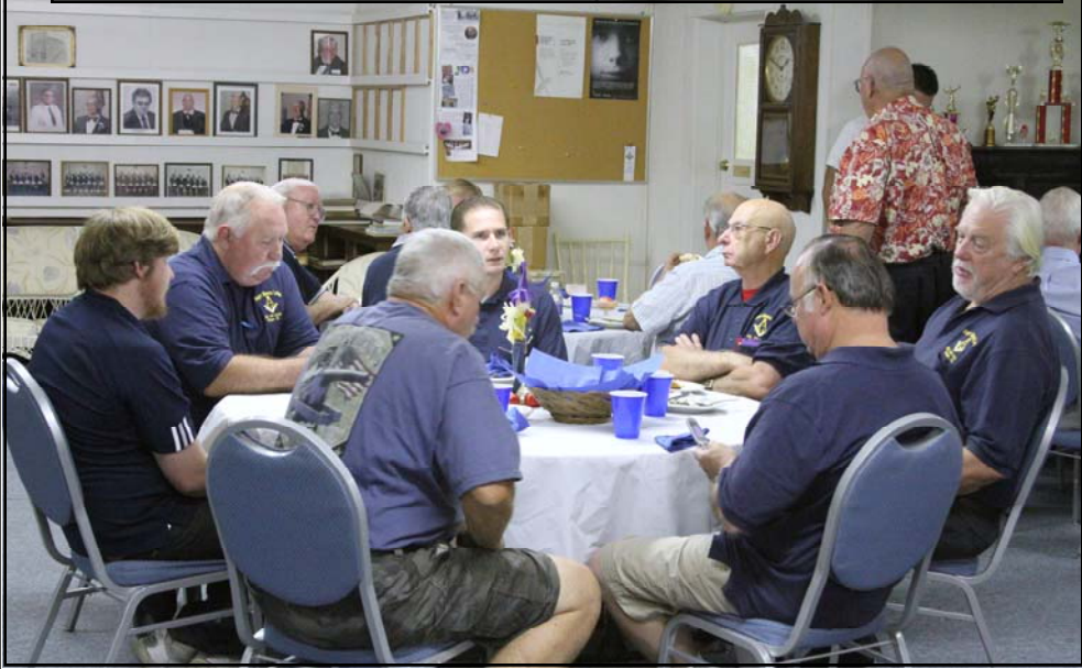
Selma Masonic Center, Officer's School of Instruction, Dinner