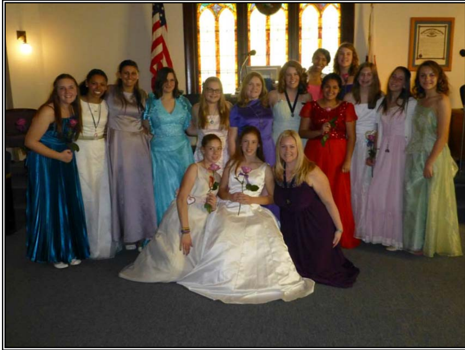
Daughters of the Nile , Serving February 10 th