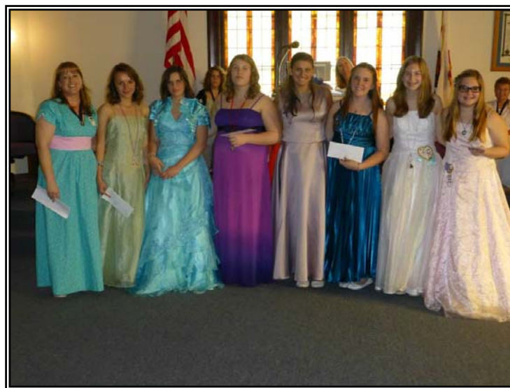
Presentation of Term Merit Bars ~ Great job!