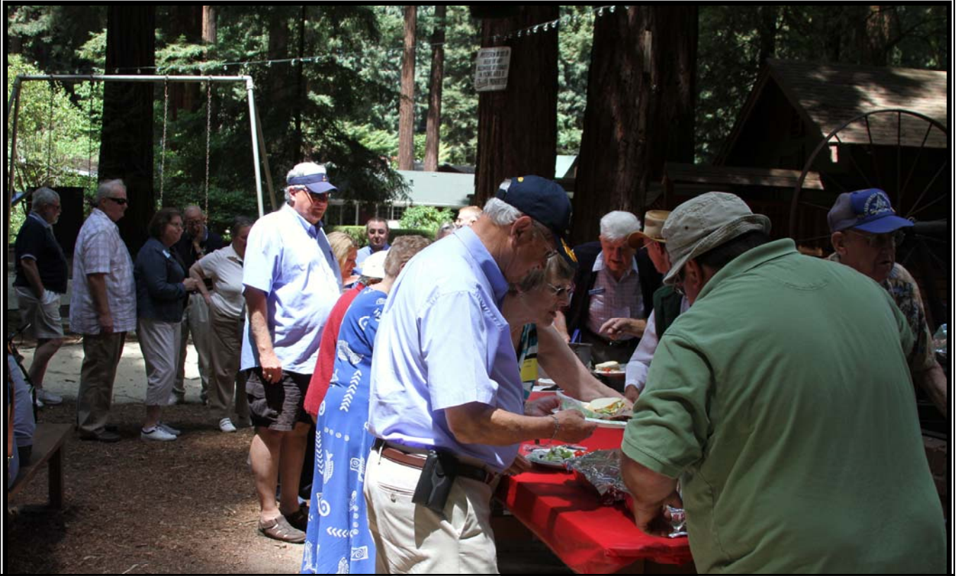
Worshipful Cooper and Grand Lodge Officers in the serving line