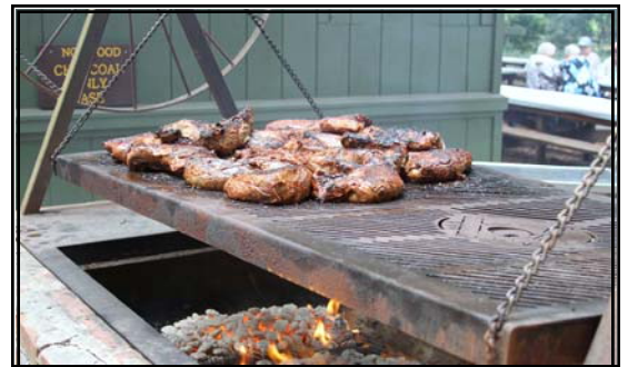
Cooking on a Masonic Grill!