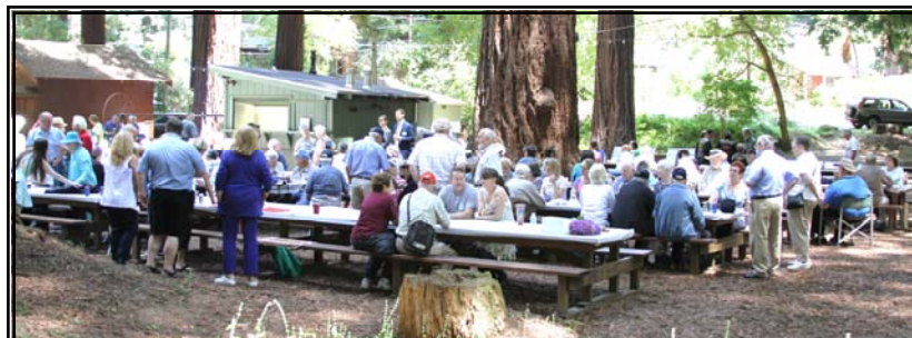
Grand Master's Luncheon, Paradise Park Masonic Club