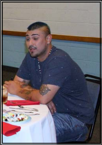
Prospects attending July Stated Meeting Dinner